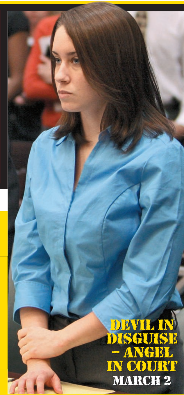
DEVIL IN DISGUISE - ANGEL IN COURT MARCH 2