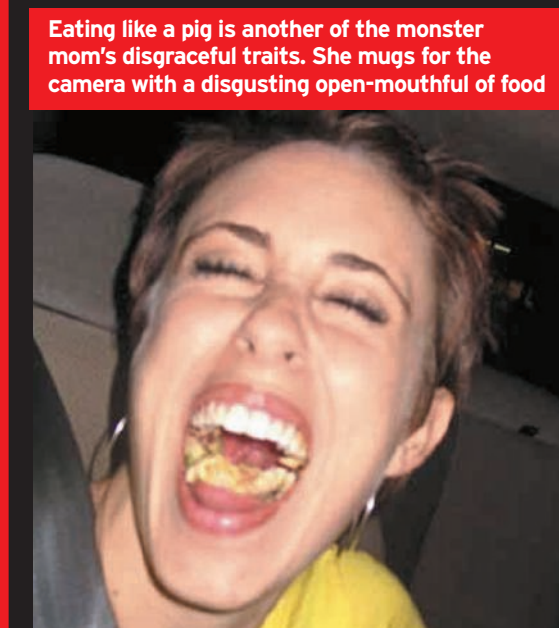
Eating like a pig is another of the monster mom's disgraceful traits. She mugs for the camera with a disgusting open-mouthful of food