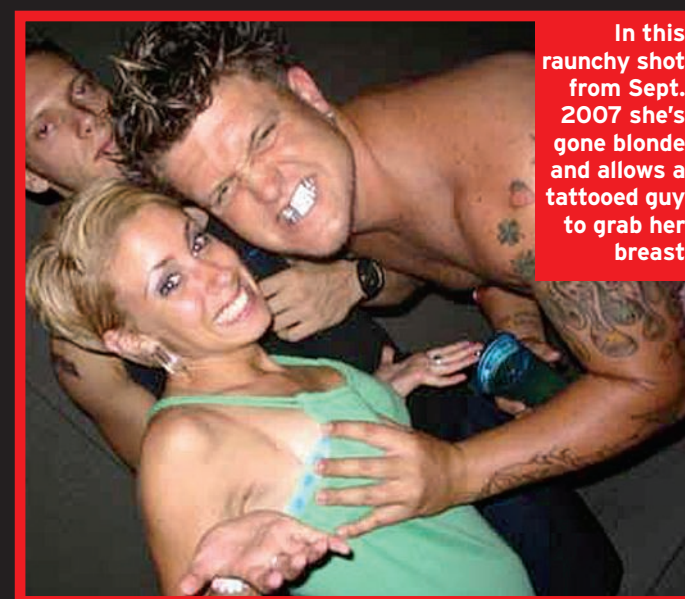
In this raunchy shot from Sept. 2007 she's gone blonde and allows a tattooed guy to grab her breast